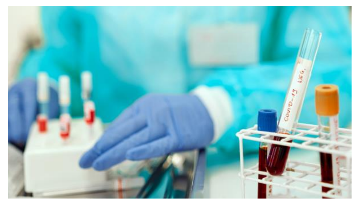
Types of work exposing employees to biological agents

When performing their work duties certain employees are more exposed to being infected with SARS-CoV-2 virus. Such situations occur in jobs involving intended or unintended contact with a biological agent. Employers are required to ensure their employees a proper level of protection against the risk of contracting COVID-19.